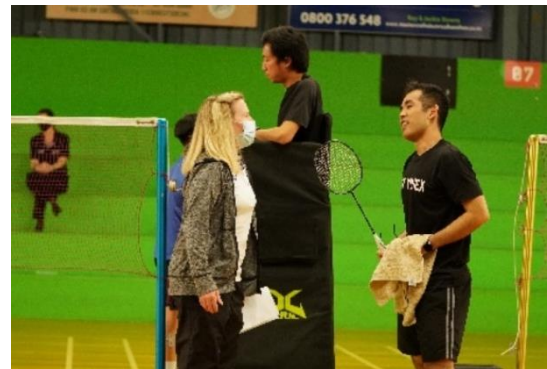
Coaching during YONEX Waikato Open / NZ Tour