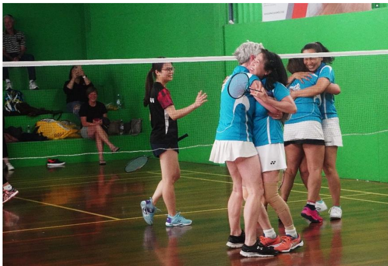
Celebrating a very close tie during Atalanta Jamboree finals

period. Levels of competition remained high with Waikato players managing to secure a few of the titles.