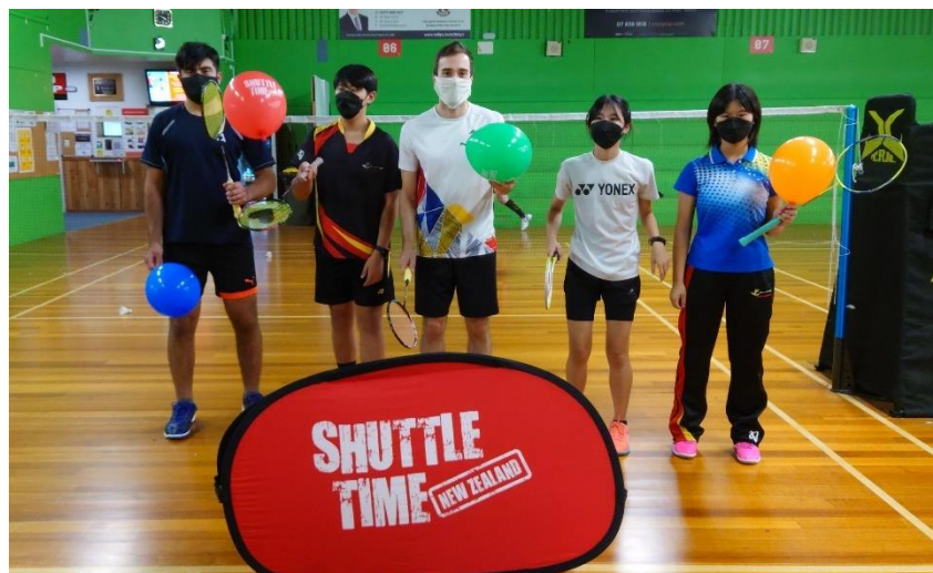
Shuttle Time Coach/Youth Leader Award participants

We have continued to grow our coaching database throughout the year. We held a Shuttle Time Coaches / Youth Leadership Award course and then integrated the participants into our school and club sessions to put the theory they've learnt into practice. These new coaches are offered guidance from trained tutors as they continue their coaching journey. The adults on the course took on coaching teams at NZJTC learning new skills along the way.