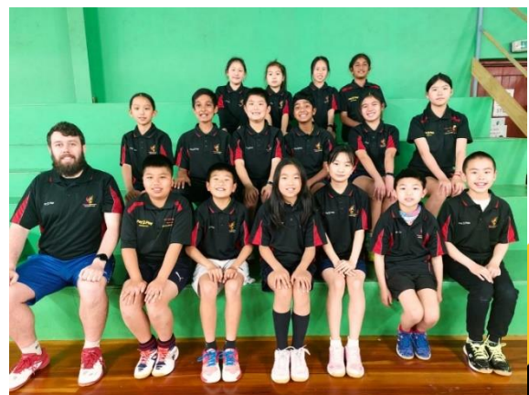
2022 Junior Development Squad