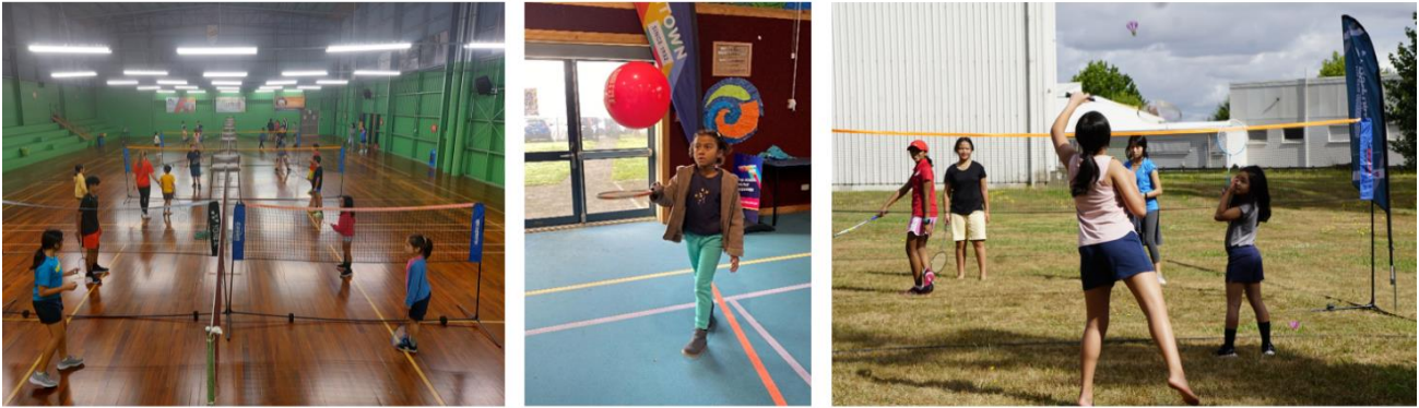
Various Shuttle Time Programs in action

The Werder Rackets Shuttle Time Junior Non-Rep Tour continues to go from strength to strength. Our biggest tournament of the year saw over 90 competitors participate. Each tournament brings in new unique competitors with some travelling from as far as Whakatane and Auckland to compete. A big thank you to Werder Rackets for supporting the Tournament again this year. They kindly donated rackets to give away at the last event for the players who came out top of the Werder Rackets points prize. This award is designed to encourage sportsmanship, fair play, perseverance and resilience, all attributes we want to encourage in our young players.