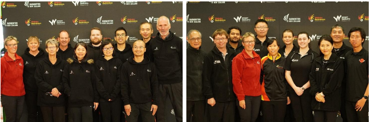
YONEX Waikato Open / NZ Tour Technical Officials

Post U15s we were quickly gearing up for what could be called our most prestigious tournament of the year: YONEX Waikato Open. This event was the first in the inaugural NZ Tour. With this came challenges and a higher level of expectation in the delivery. All matches had qualified umpires, plus line judges for semis and finals and a referee + trainee referee on site. Thank you for those that put their hands up for these roles. Waikato set the bar very high, giving other associations a lot to aim for. Three days of competition lead to some very exciting finals, all which were live streamed over Facebook for supporters to view from wherever they were around the world. Next year we are hoping to have an even higher level of competition within this event.